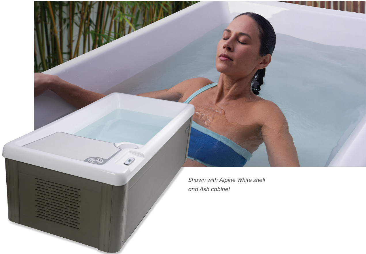
Shown with Alpine White shell and Ash cabinet

People Voltage Capacity 1 Seat 115 V 110 gallons | 425 liters