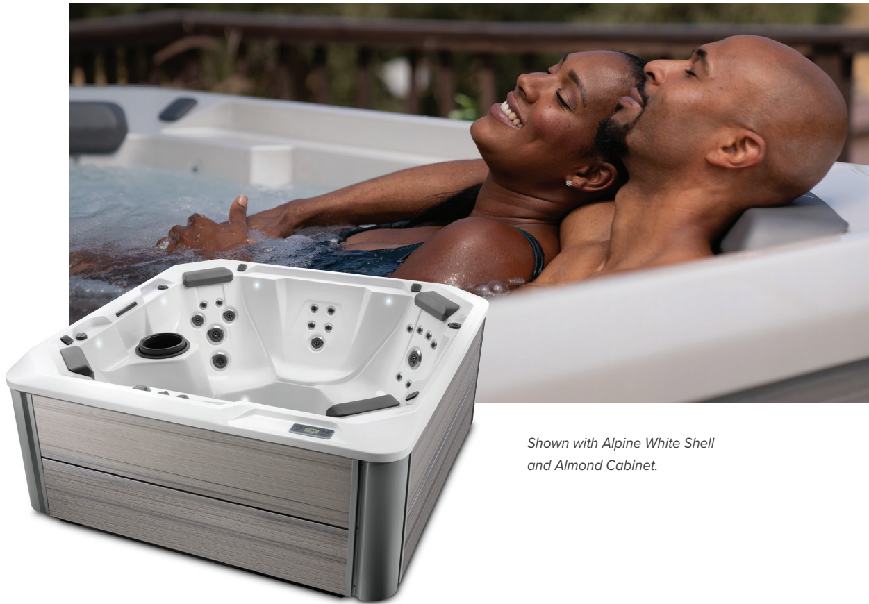
Shown with Alpine White Shell and Almond Cabinet.

People Seating Jets Voltage 7 Seats Open 40 Jets 230 V