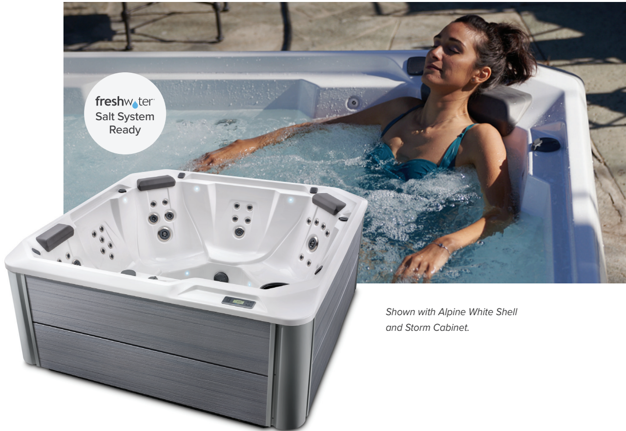
Shown with Alpine White Shell and Storm Cabinet.