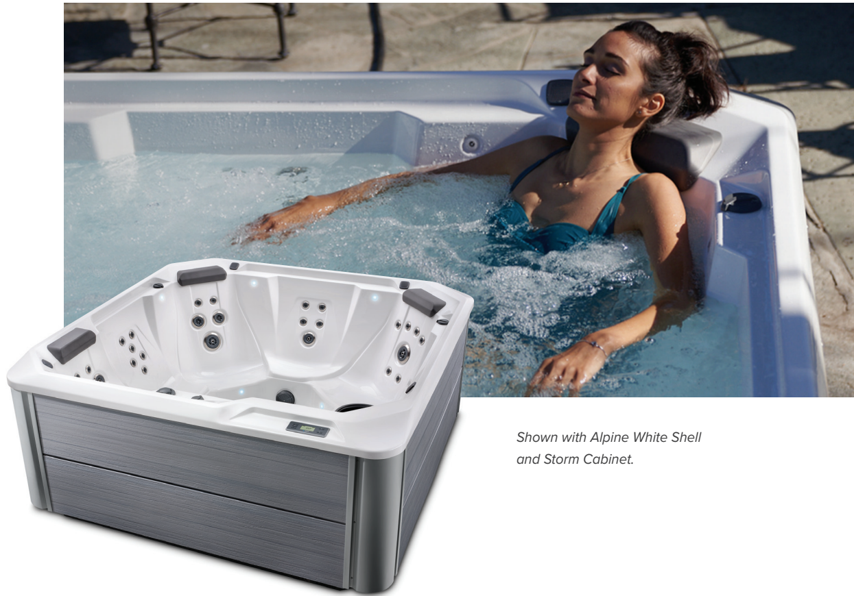
Shown with Alpine White Shell and Storm Cabinet.