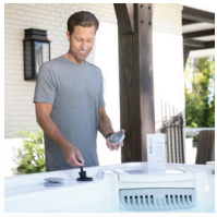
FreshWater® Salt System Ready