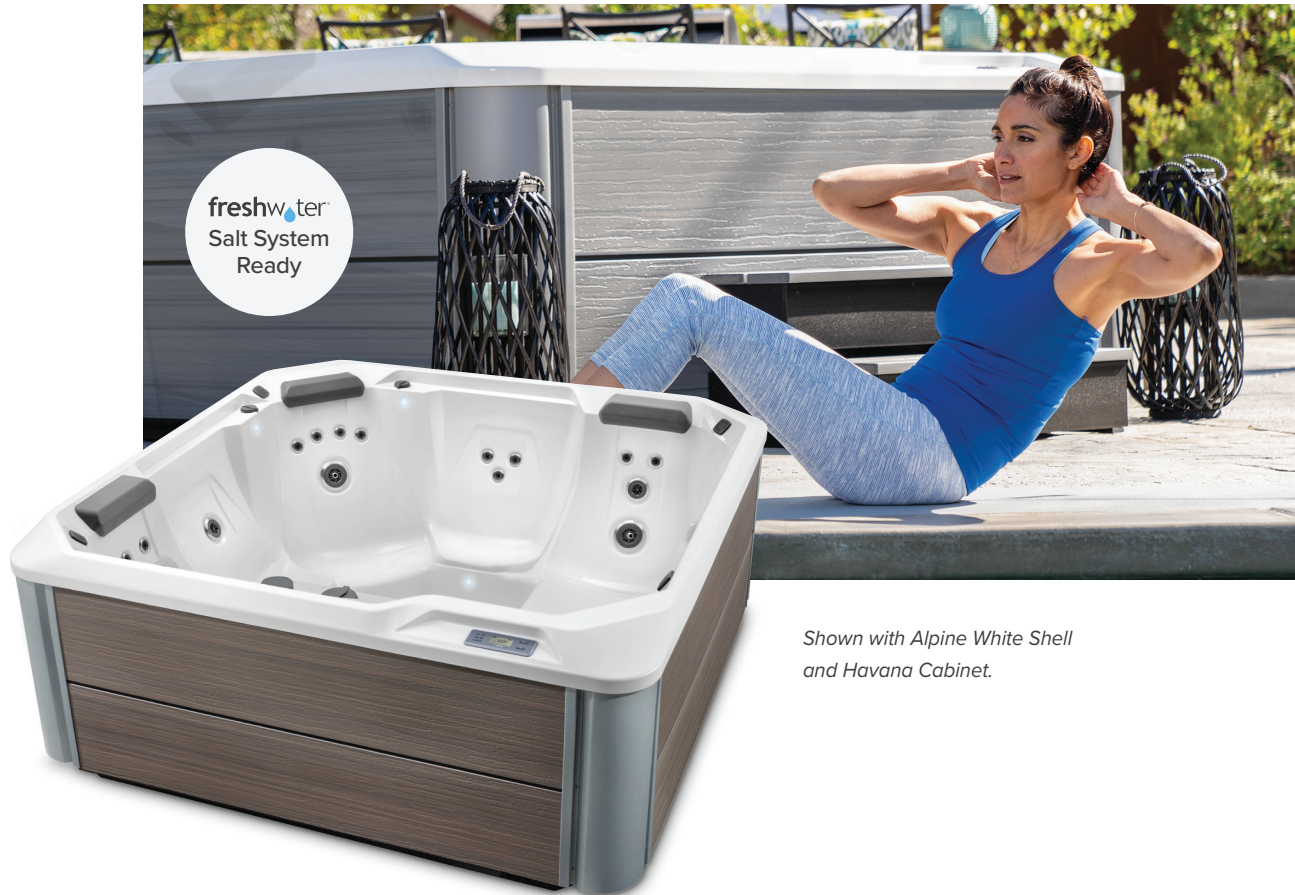
Shown with Alpine White Shell and Havana Cabinet.